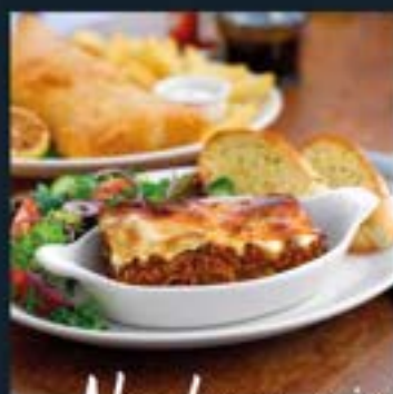
No-fuss night out