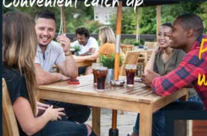
Post-work wind down