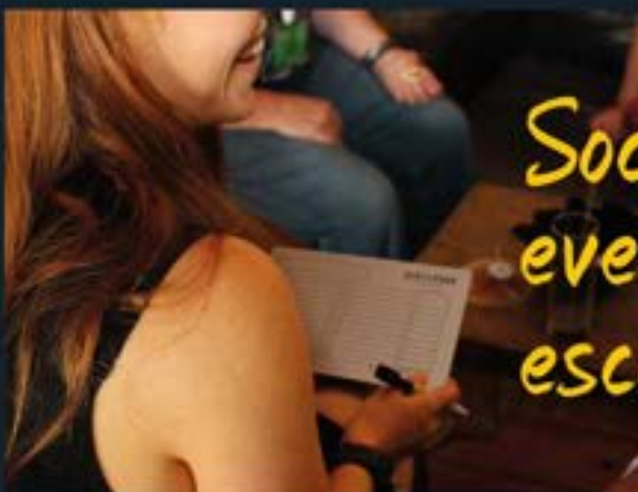
Social everyday escape