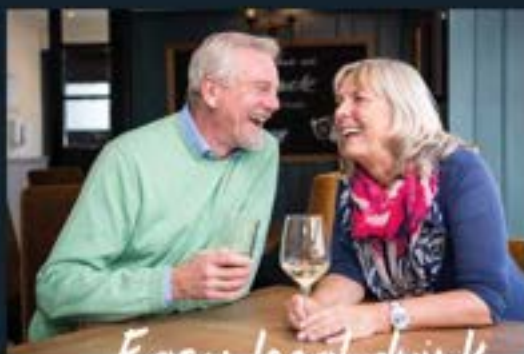
Easy local drink

Hive pubs are conveniently round the corner; easy to walk to or easy to park at. A great place to socialise as a group or with the locals. Hive pubs have a great atmosphere with something always going on from sport and quizzes to live local music. Hive includes a great-value, good quality food offer, focusing on pub classics as well as an excellent drink range.