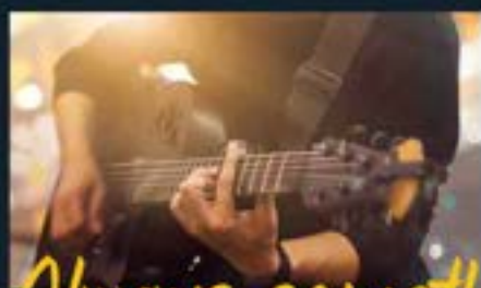
Always something going on